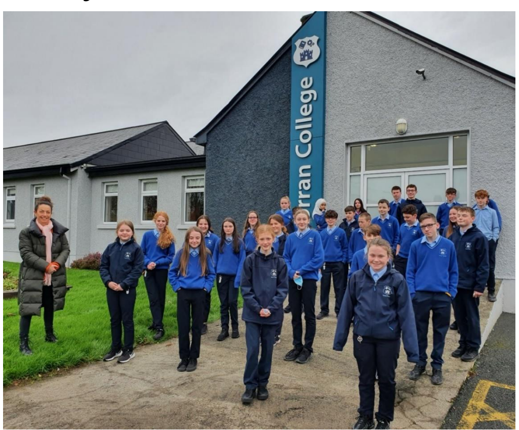
Young peoples school nutrition Project - Students at Corran College, Ballymote