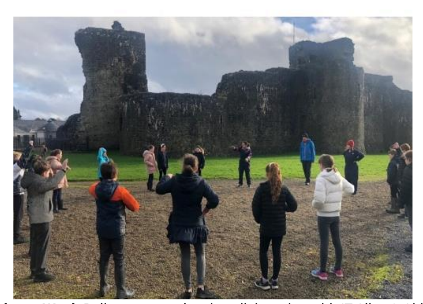
Science Week, Ballymote - project in collaboration with IT Sligo & Abbvie

Due to the ongoing impact of Covid 19, most verifications were carried out virtually – projects visited include Birdwatching talks via zoom, QQI Level 4 Online Community Mentoring and Advocacy Training, Rethinking Community Communications, Basic Book-keeping, Intro to Menopause, Start Your Own Business and IT Sligo - Science Week Activities.