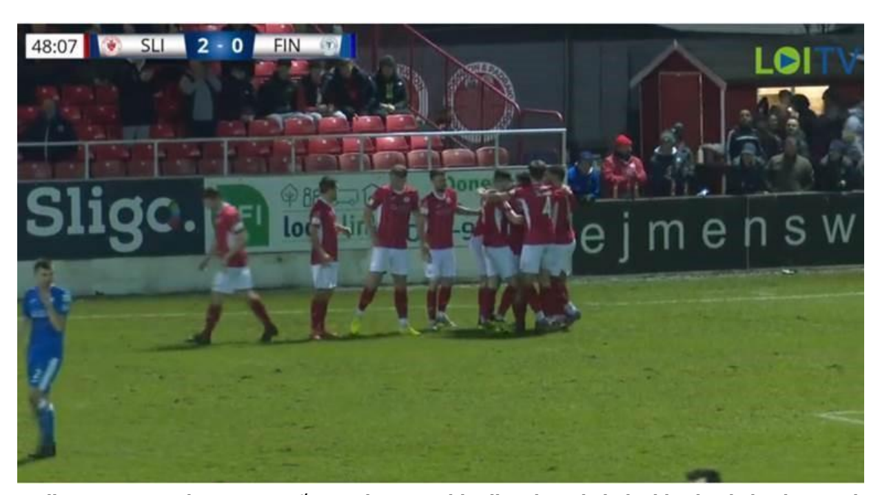
Sligo Rovers v. Finn Harps 14<sup>th</sup> March 2022 with Sligo. brand pitch side sign in background