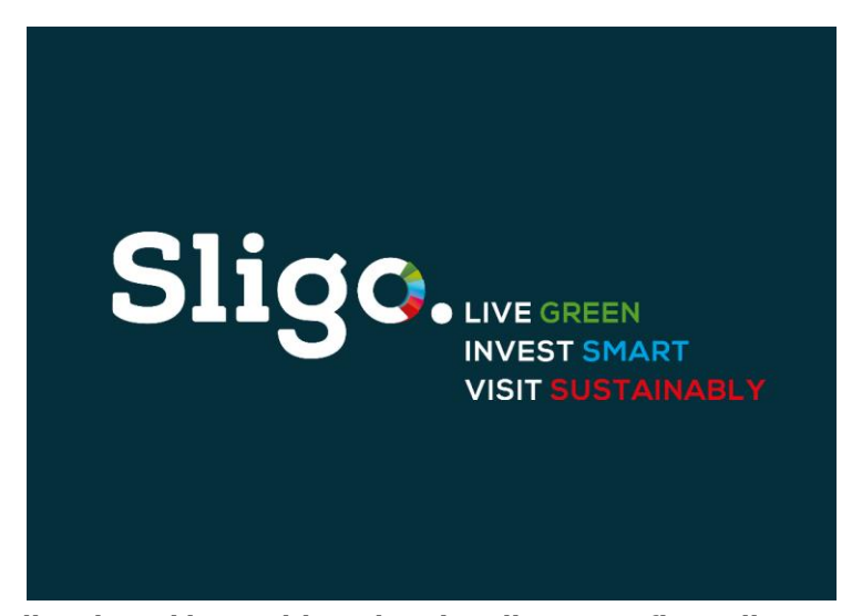
Sligo. brand logo with updated taglines to reflect Sligo 2030

Sligo: Live Invest Visit was developed as a unique umbrella brand that helps deliver a positive message for Sligo. This gives organisations, community groups and the people of Sligo a central brand under which all of the positive Sligo stories can be celebrated and promoted. Under the 3 pillars of live/invest/visit the new brand presents an opportunity for Sligo to promote a positive image which will entice visitors and investors to the area to enjoy the Sligo landscape, culture, educational and innovative opportunities, with excellent choice and quality of life.