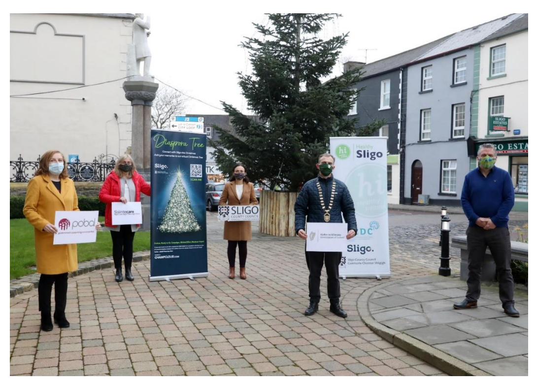
Launch of the virtual Christmas