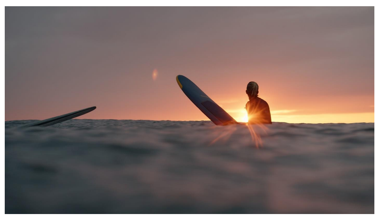
Screenshot from "Sligo - so much more than a beautiful place" video