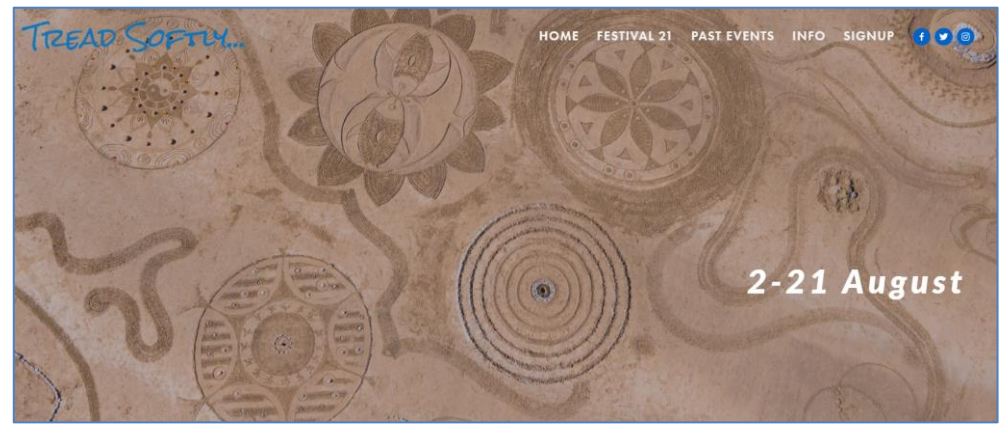
(Above: Some of the festivals that received funding from the FI Regional Festivals Scheme 2021)