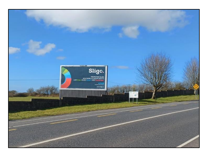
Sligo. brand billboard Pearse Rd route into Sligo Town

(approximately 25,000 vehicles per day use Hughes Bridge). This has aided brand recognition among the local public as well as the brand stakeholders.