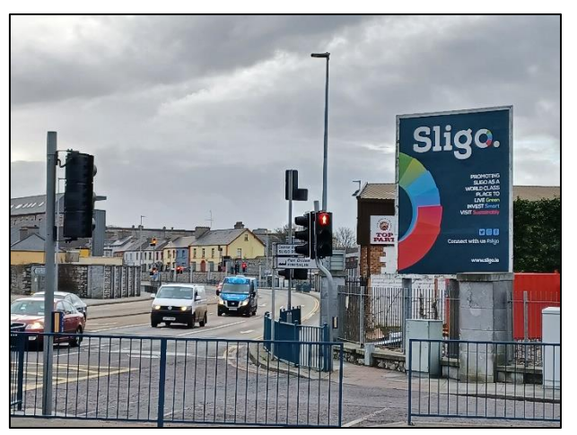
Sligo. brand sign on Hughes Bridge