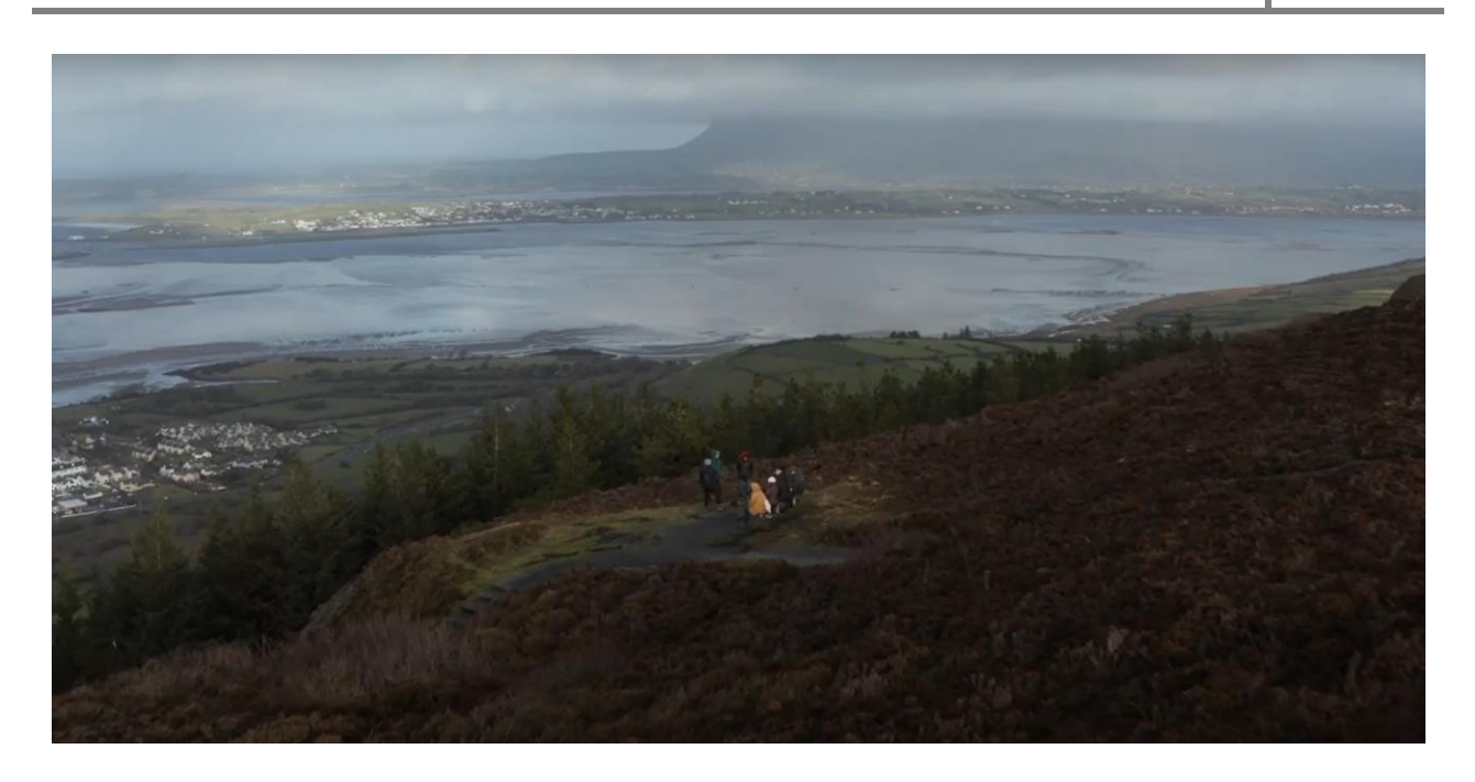
Screenshot from Diaspora video launched for St Patricks Day 2021 which attracted 170,000 views across all channels