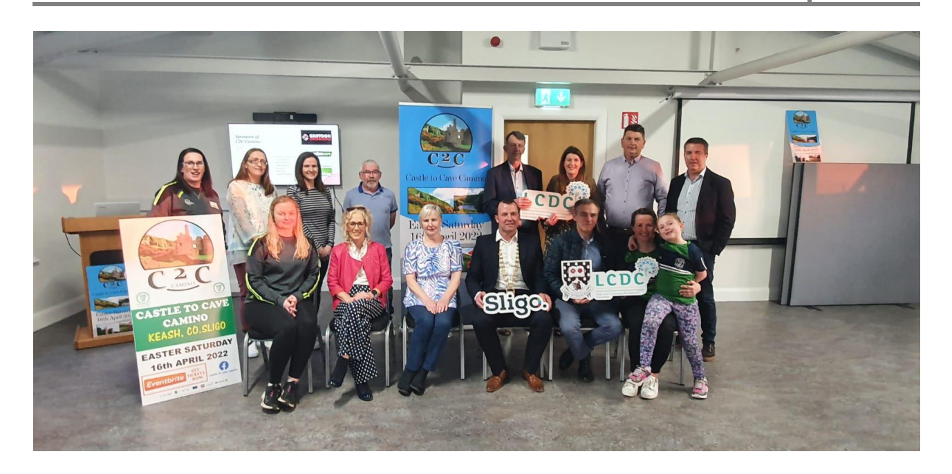
Members of Sligo County Council and Sligo LCDC with the Project Promoter (Eastern Harps GAA) at the