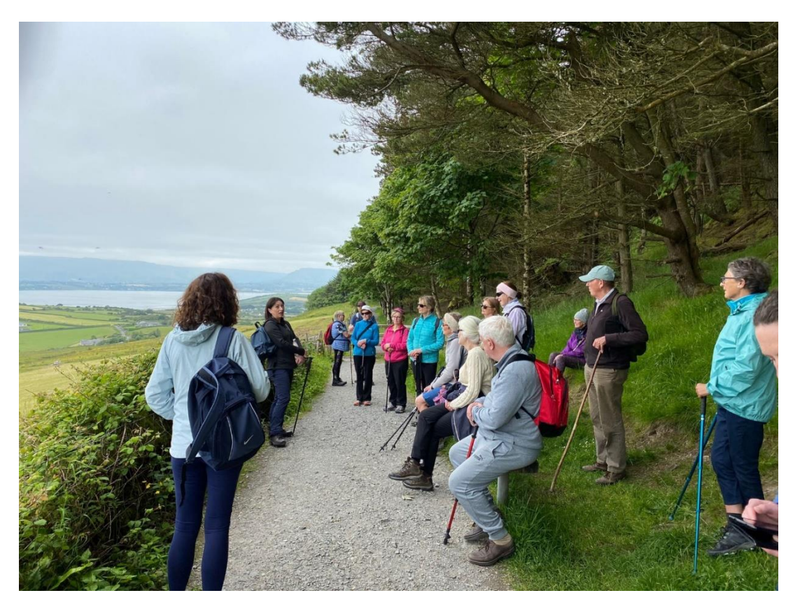
Walks during Lockdown on Knocknarea