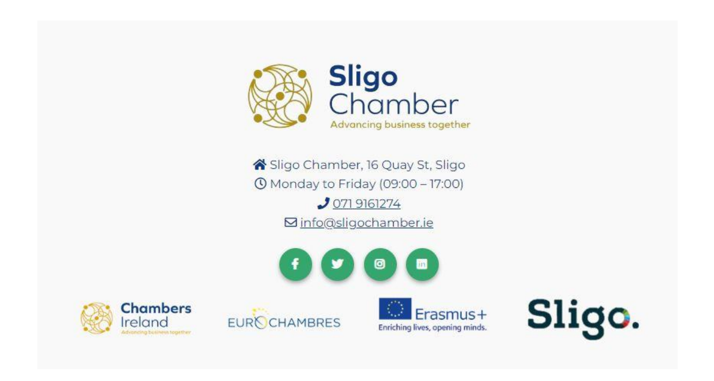
Sligo. logo included on SEF Member website - Sligo Chamber of Commerce

The Sligo. brand has been successful in producing online video content as part of the communications strategy to promote the brand objectives. The first in a series of 3 new Sligo. brand videos launched on 4<sup>th</sup> February 2022. The video, titled "Sligo – so much more than a beautiful place" has enjoyed a reach of over 50,000 views to date. It focused on the aspects of modern life in County Sligo and depicts the benefits of living in Sligo; its work-life balance, quality of life, unspoiled landscape, affordability and accessibility