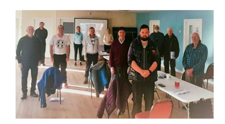
Willow Weaving Workshop at Enniscrone FRC